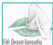
With Deepest Sympathy